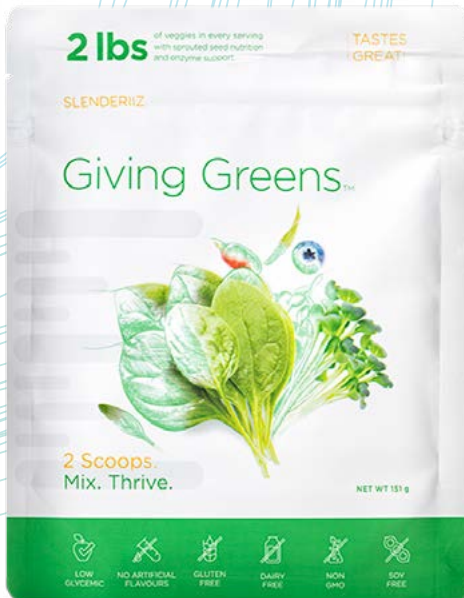
*US product packaging, not available for resale.

4 billion good bacteria join with acacia gum to make a live cultures system that provides numerous benefits to your health. Together, they help improve nutrient absorption, support weight management, increase skin hydration and clearness, while supporting whole body health.