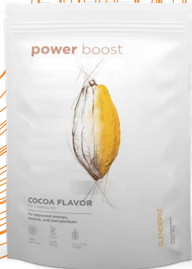
*US product packaging, not available for resale.

Use Power Boost as an addition to PureNourish or on its own to help replenish your body nutrients with the nutrients it needs.