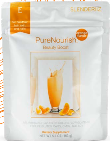
*US product packaging, not available for resale.

Whether you're experiencing a decline in the quality of your hair and skin, or you're simply looking for an extra boost to your beauty regimen, this powerful supplement will have you feeling renewed and restored.