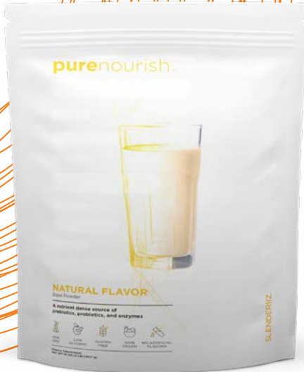
*US product packaging, not available for resale.

Mix two scoops of PureNourish with your choice of Beauty Boost or Power Boost and 8 oz (235 ml) of cold water. Shake vigorously to blend. For a creamier shake, use plant-based milk.